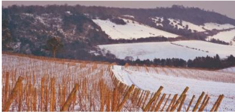
Vines under snow on Surrey's South Downs. Soon to be a sight of the past?